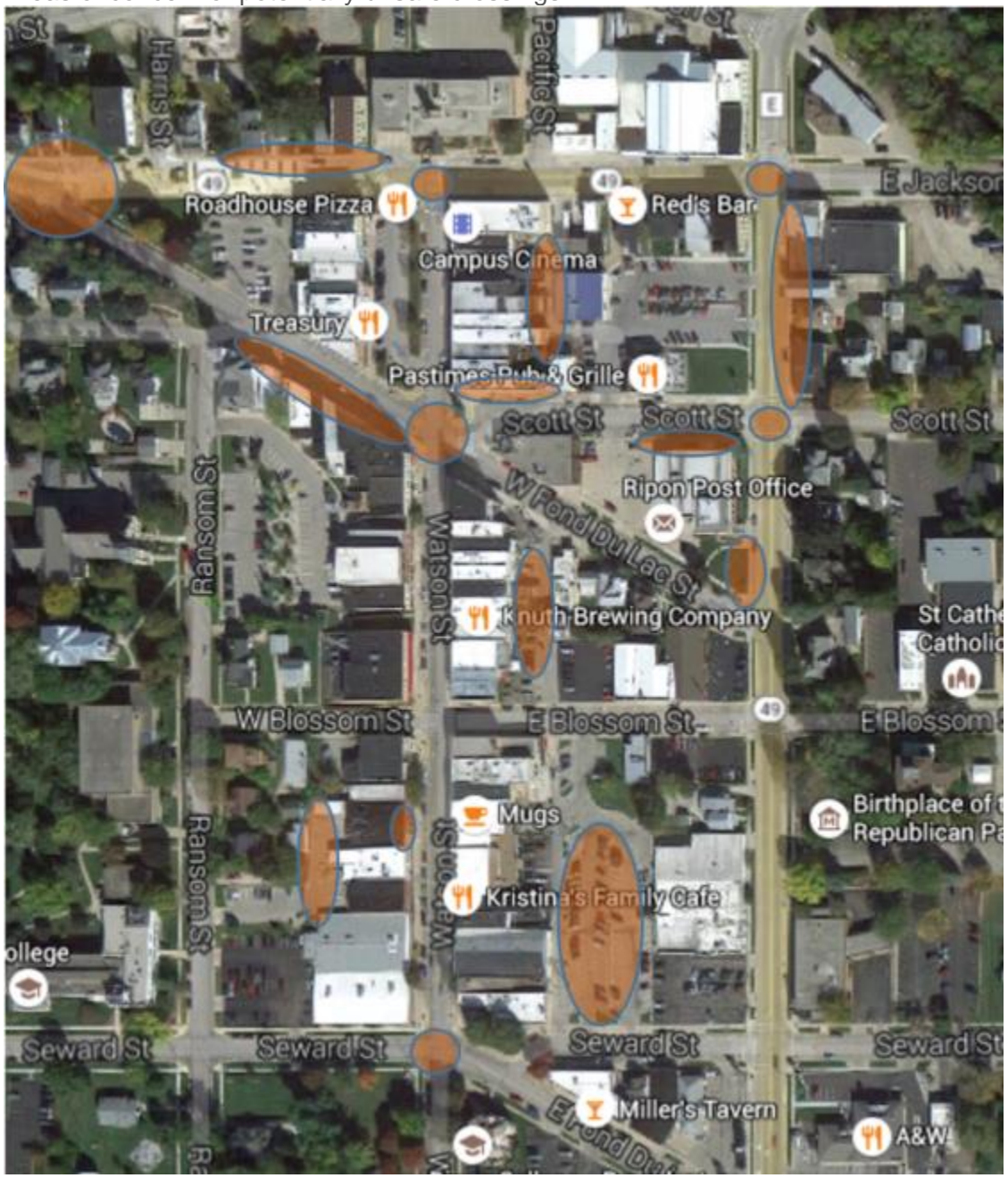
Areas of concern or potentially unsafe crossings

The fourth and final exercise in this station was to identify individual buildings or sites that are currently underutilized and which should be redeveloped or enhanced either through a facade enhancement project or the introduction of a new market supported tenant. The list on the following page identifies the location of each property identified as potentially needing improvement, along with a list of uses which were identified as desirable. In some cases the uses were assigned to individual properties, while in others no individual property was perceived to be a good fit at present. By and large, sites identified for improvement in the streetscape exercise were the same ones identified for redevelopment or other improvements in this exercise.